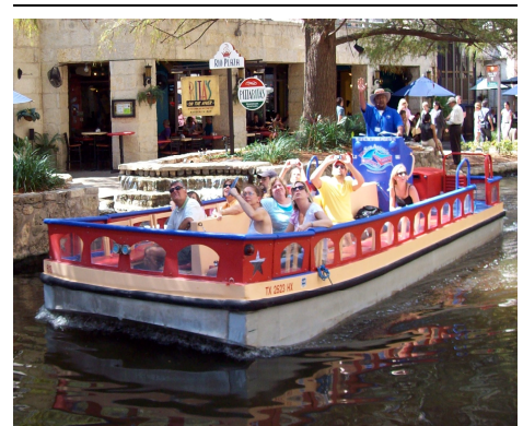
Keep all body parts inside the boat.