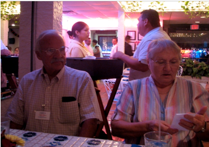
You ordered what??