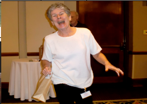
I have no idea what I said to her.