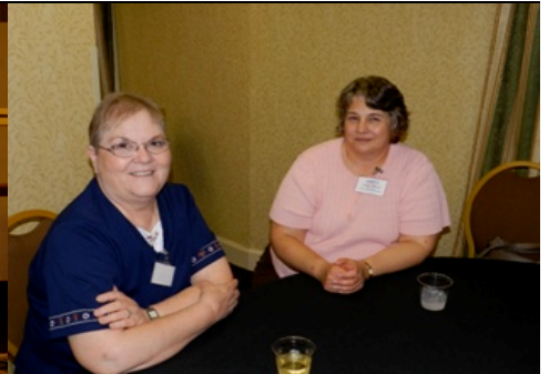
Sly grins means there is something extra in the glasses.