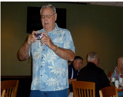
Wonder how this thing works!?