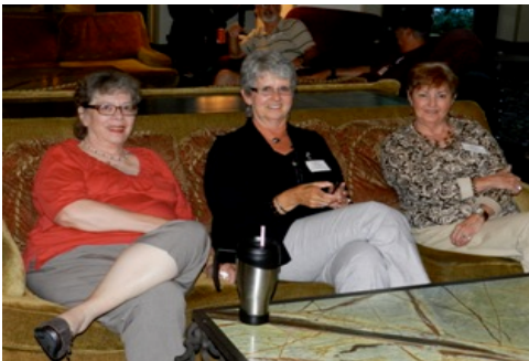
That's really a double Martini in that hot cup.