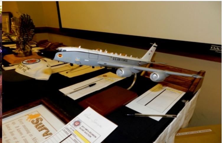
Silent Auction Item