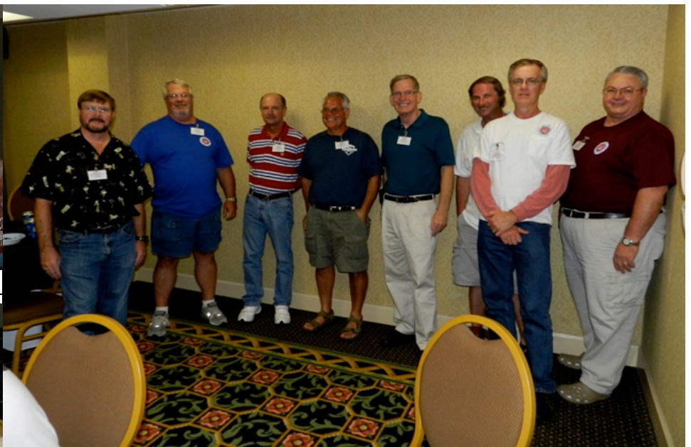
A round up of the usual suspects.