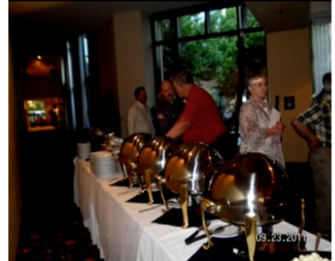
I'm getting hungry just looking at this.

Editor's note. Just printed a coupon for $10.00 off a $25.00 purchase at Dick's Sporting Goods. Not bad.